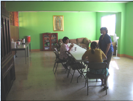
New visitor quarters at Jesus, Redeemer Center