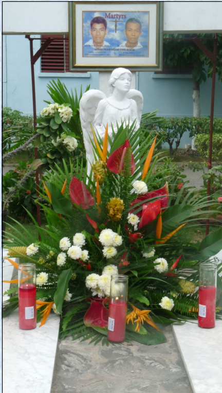
Anniversary of the Martyrs