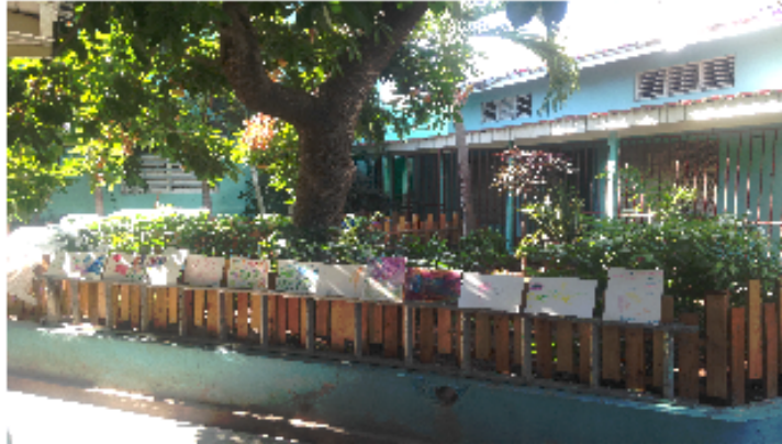
Art on display at Jacob's Well in Kingston, Jamaica

In the Fall of 2014, I had the priviledged of working with the Missionaries of the Poor in Kingston, Jamaica again. On this particular trip, I brought along art supplies and spent time in with the women of Lord's Place and Jacob's Well creating art!