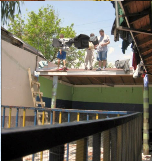
On roof working laundry duty!