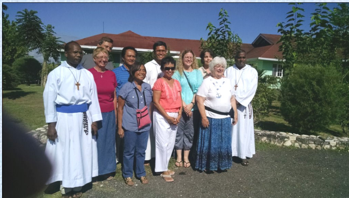
Part of the Group at Mt. Tabor